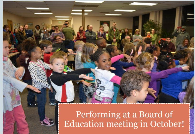
Performing at a Board of Education meeting in October!